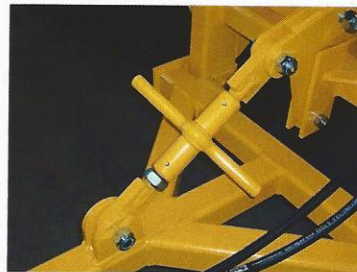
FRONT MOUNTED TURNBUCKLE ADJUSTS MACHINE LEVEL TO TRACTOR HITCH HEIGHT. LINKAGE WILL THEN KEEP MACHINE AT THE SAME LEVEL FROM DISCING TO TRANSPORT.