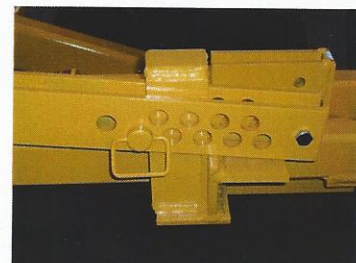
DEPTH CONTROL SET BAR WITH TRANSPORT SAFETY PIN IN PLACE. OPTIONAL CENTER SHANK AND SWEEP.