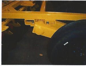
HEAVY DUTY AXEL SHAFT WITH 4 LUBRICATABLE BEARINGS.