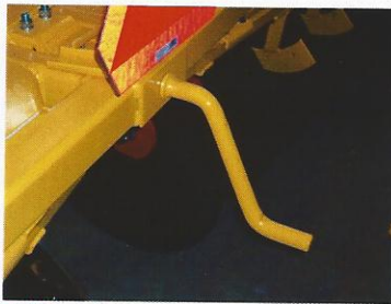
REAR GANG SETTING IS A QUICK & SIMPLE TURN OF A CRANK. BOTH GANGS ARE COUPLED TOGETHER IN POSITIVE MATCHED ANGLES FOR A SMOOTH AND LEVEL FINISH.