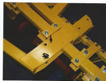
GANG ANGLE SETTING IS TYPICAL DOMRIES QUICK PULL PIN SETTING. POSITIVE MATCHED ANGLES WITH NON SLIP GANG BARS AND ALL WITH NO WRENCHES.