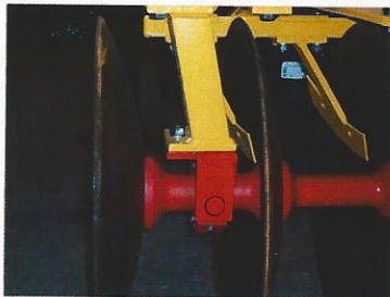
HEAVY CAST IRON SPOOLS. TRUNION SELF ALIGNING BEARINGS TRIPLE SEALED BALL BEARINGS. RUGGED STEEL BEARING BRACKET. A REAL WINNING COMBINATION