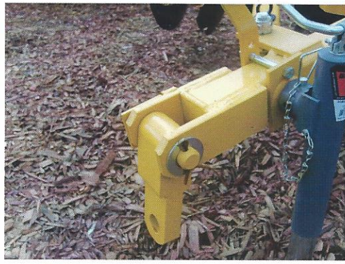
SINGLE TONGUE HITCH IS STANDARD DOUBLE LIP IS OPTIONAL