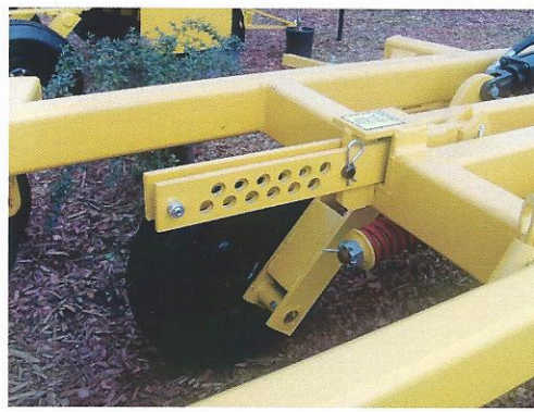
DEPT CONTROL SETBAR WITH TRANSPORT SAFETY PIN IN PLACE.