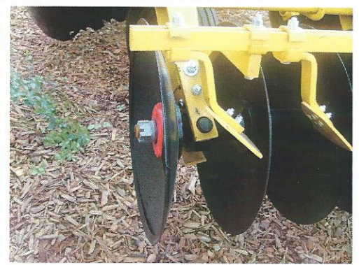
HEAVY DUTY WEAR PLATE AND ADD-A-BLADE EXTENSION WASHER IS STANDARD EQUIPMENT.