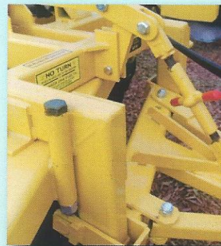
THE RUGGED TOP LINK LEVELS THE TRACTOR HITCH. LINK CAN ALSO TRANSFER WEIGHT FROM FRONT TO FRONT.