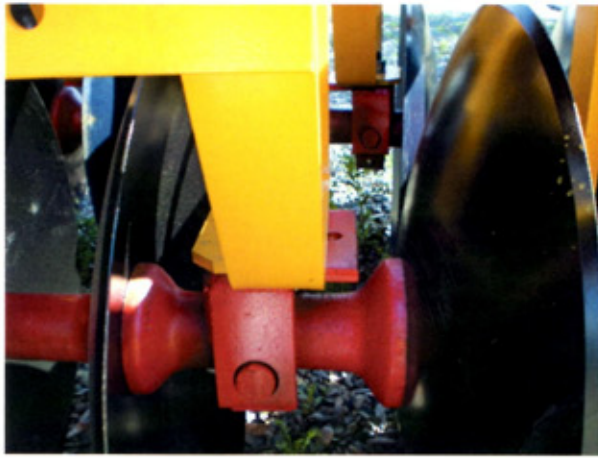
ADD A BLADE – QUICK 3 CAP SCREWS – 18" WIDER CUT