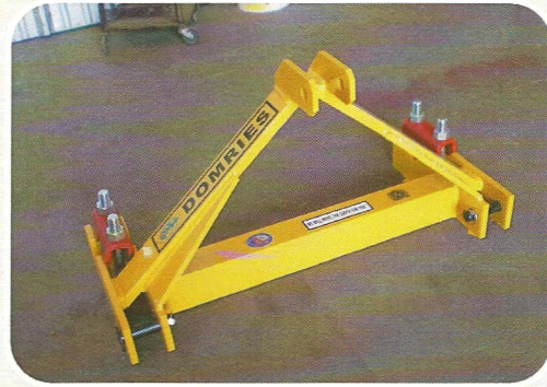
AFC-108 AFC-107 SAME STYLE AS 108